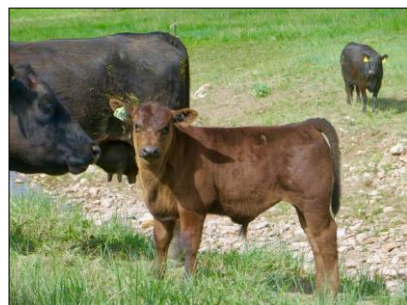
A 3R Ranch calf on pasture

The Browns quickly adjusted their program from south Texas to the ranch’s 7400-foot elevation and have been striving to improve cattle and land ever since.